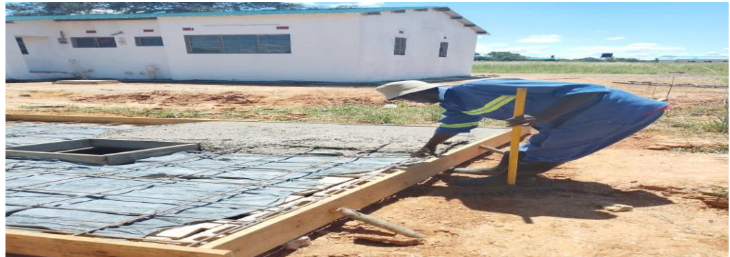
Mulanfu House No. 2