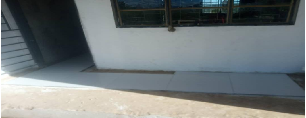
Mulanfu House No. 1