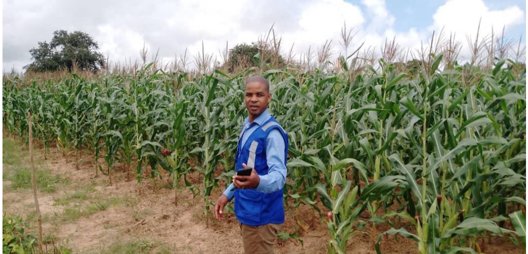
The District Agricultural Coordinator at the Misika Farmer Field School (FFS)