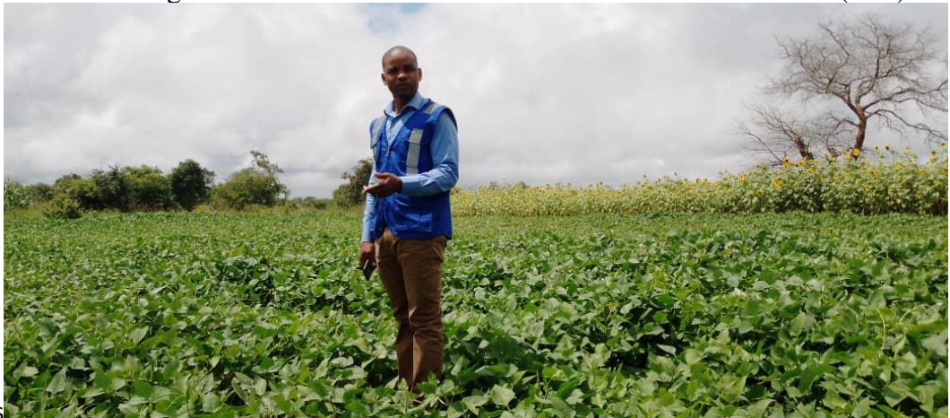
The District Agricultural Coordinator at the Misika Farmer Field School (FFS)